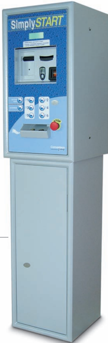
Version with panel

To manage the entire plant with only one payment station.